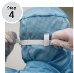
Step 4 Adjusting the strap