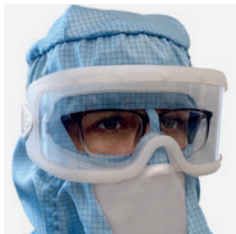
Suitable protective goggles for spectacle wearers