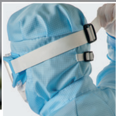
Goggles with belt strap and buckle