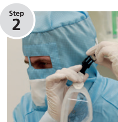
Step 2 Inserting the buckle on the first side