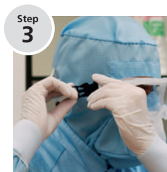
Step 3 Inserting the buckle on the second side