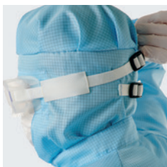
Goggles with narrow strap & fixed grommet