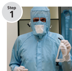
Step 1 Removing the goggles from the packaging

Just two „clicks“ and pulling on two straps – the protective goggles fit and are fixed!