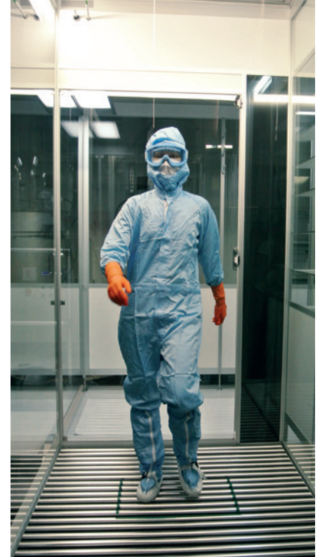
Fig. 2: Test person simulating walking movement in the Body-Box

The metrological basis for the 2015 study and also for the new study presented here was the use of a relatively new measuring instrument from TSI Inc.: the BIOTRAK® 9510-BD. With the help of this real-time viable particle counter, it is now possible to quantitatively detect airborne microbes and, if necessary, to analyse the collected airborne microbes. The operation of the counter is shown opposite Info box „Measuring method“ described in more detail. A special feature of the BIOTRAK® is that not only airborne germs can be quantitatively detected, but also airborne particulate contamination at the same time. Thus, it is possible to differentiate between viable and non-viable particles.