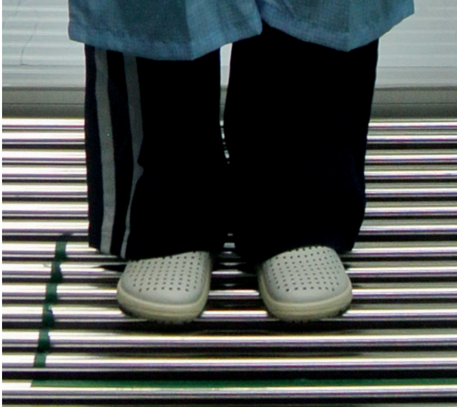
Fig. 1: Body-Box air exhaust duct