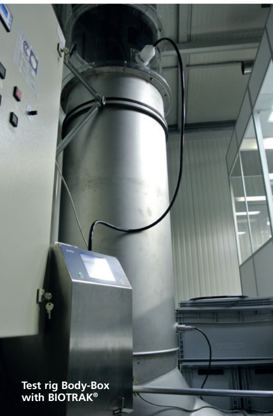
Test rig Body-Box with BIOTRAK®

For the second series of tests, the test garments were reprocessed several times under defined conditions. The cleanroom garments were decontaminated and autoclaved a total of 60 times. The intermediate garments were decontaminated once. Then, 10 tests per test person were performed again (now in the so-called old condition) according to the defined movement programme. The results are summarised in Tables 3.1 and 3.2 and presented in the form of bar charts in Figures 1 and 2. The Measurement results are, as with all Body-Box measurements, extrapolated to one cubic meter. Due to the large variance in the individual tests, only the average values are shown here.